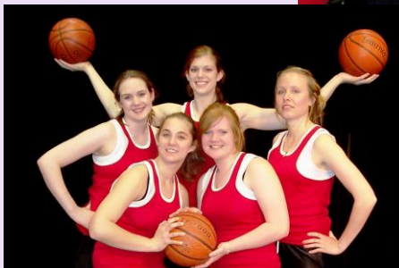
5 Women With Movement Skills

Young Comfort is a short play that addresses the Korean (and other Asian) Comfort Women of the Japanese Occupation and World War II - a fiery hot-button issue for Korea, Japan, China, Malaysia and other Asian nations exactly now.